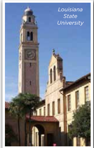
Louisiana State University