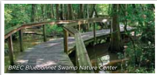
BREC Bluebonnet Swamp Nature Center

Have an adventure in a pristine 65-acre cypress-tupelo swamp and an upland hardwood forest with dramatic ravines. The two ecosystems are linked by a series of walking trails and boardwalks for exploration and magnificent views. Wildlife includes yellow-crowned night herons, owls, hawks, raccoons, foxes, bobcats, snakes, turtles and alligators.