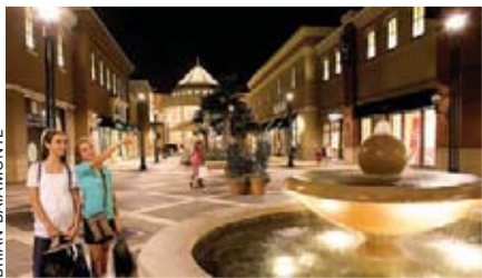
BRIAN BAIA MONTE

History collides with the ultramodern in South Baton Rouge, where trendy lifestyle centers and thriving university enclaves emerge from land that once belonged to antebellum plantations and ancient swamps.